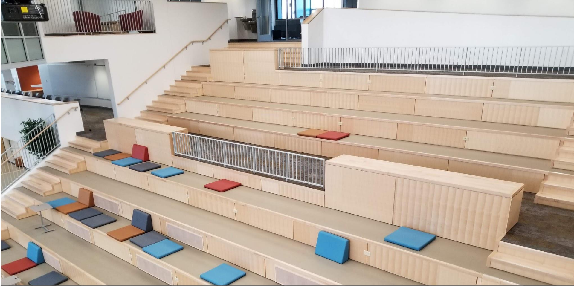
St. Vrain (CO)