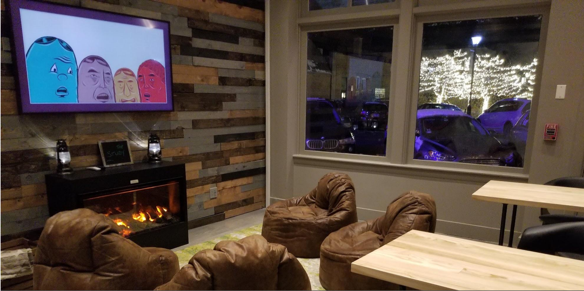
The House (IL)