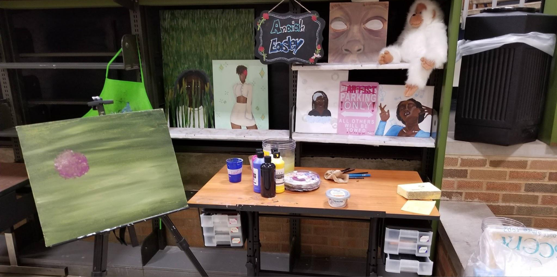
University City (MO)