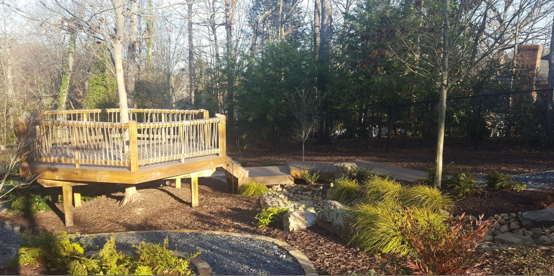
Davis Academy (GA)