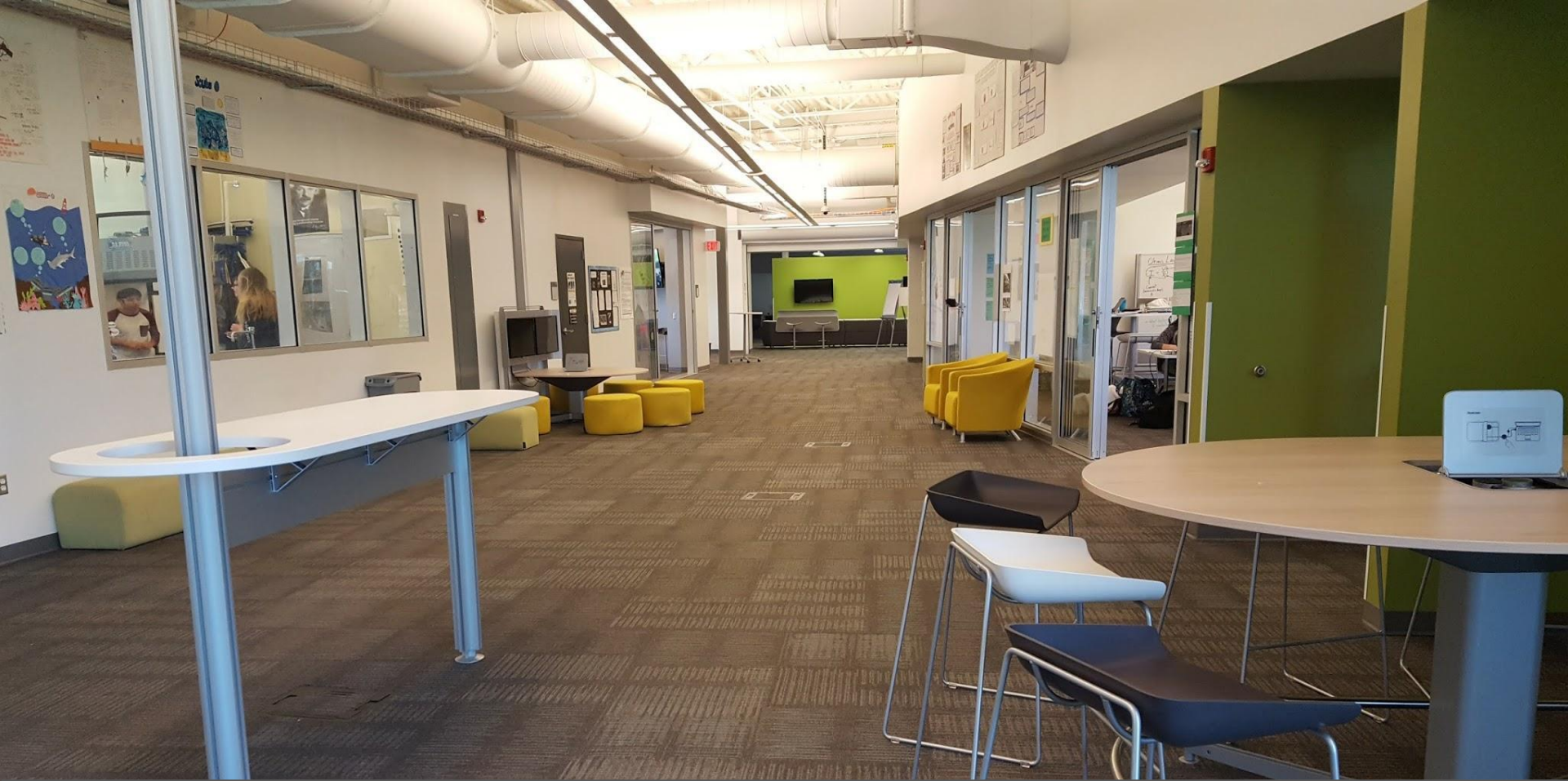
Kent Innovation High (MI)