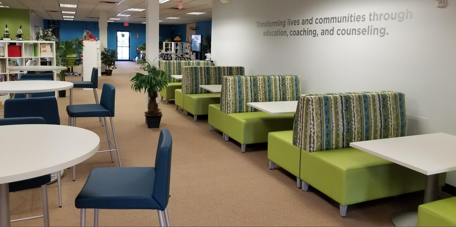
Lincoln Center (PA)